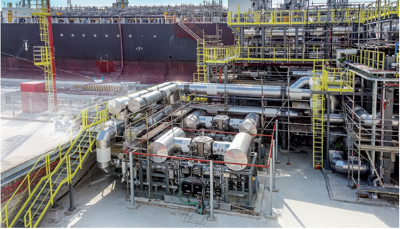
BOG compressors